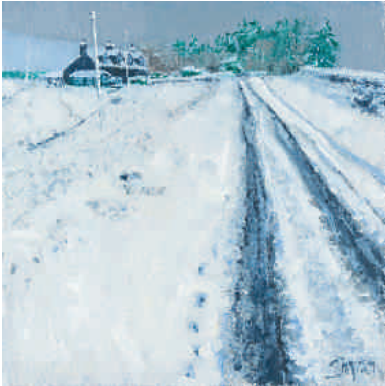
Home & Studio, Winter oil on canvas / 40 x 40 cm / 15.5 x 15.5 in