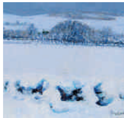
Cattle on the Hill Loch Broom Grey Winter mixed media 19 x 20.5 cm / 7.5 x 8 in