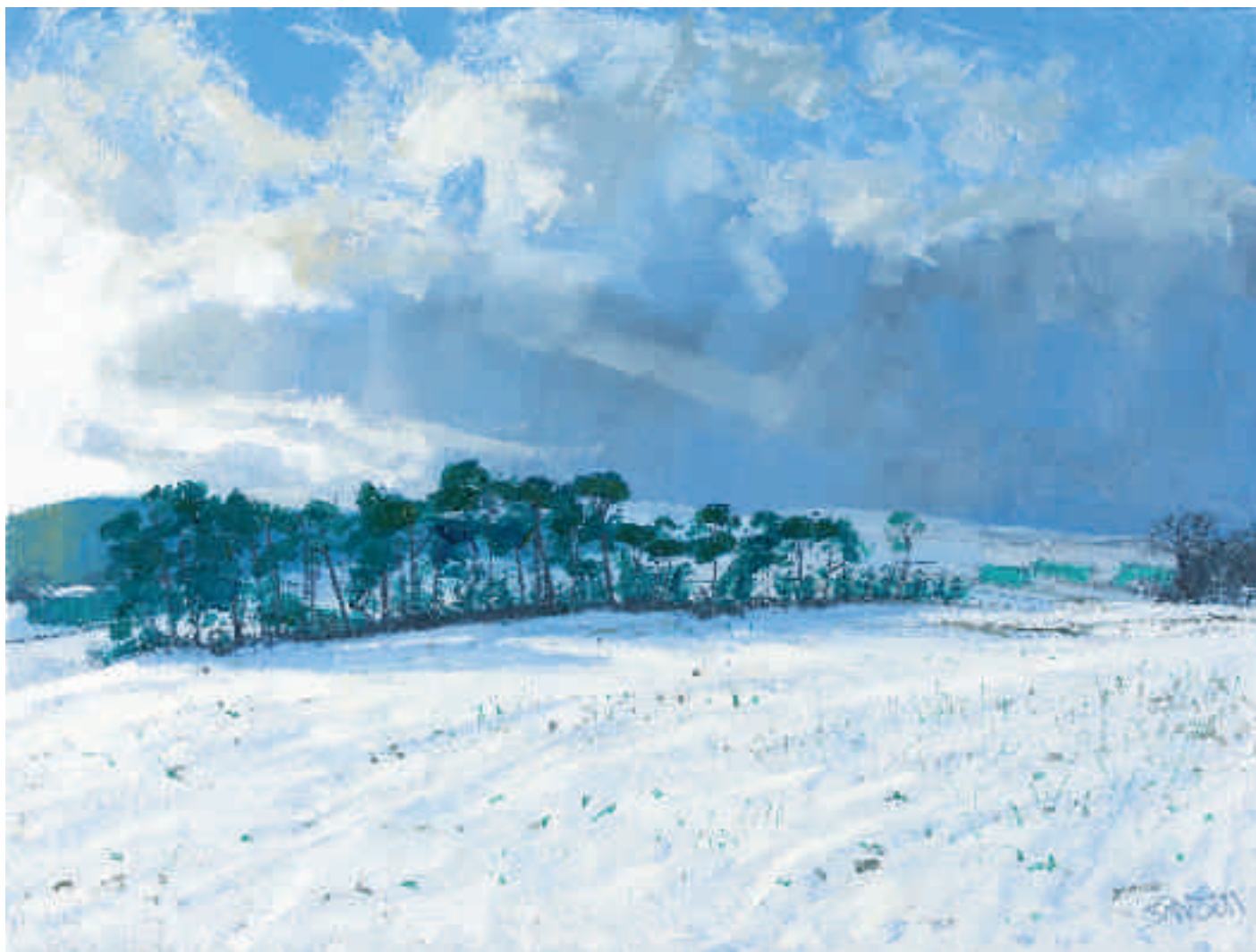
Line of Trees

oil on canvas / 60 x 80 cm / 24 x 31.5 in