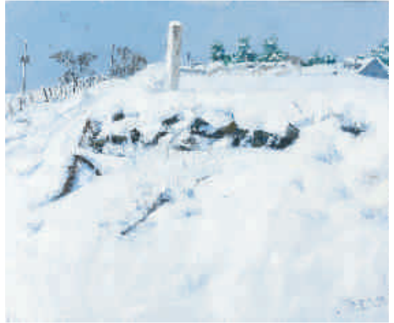
Heavy Snow oil on canvas / 46 x 55 cm / 18 x 22 in