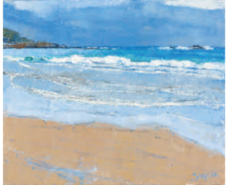
Colonsay Wave oil on canvas / 46 x 55 cm / 18 x 22 in