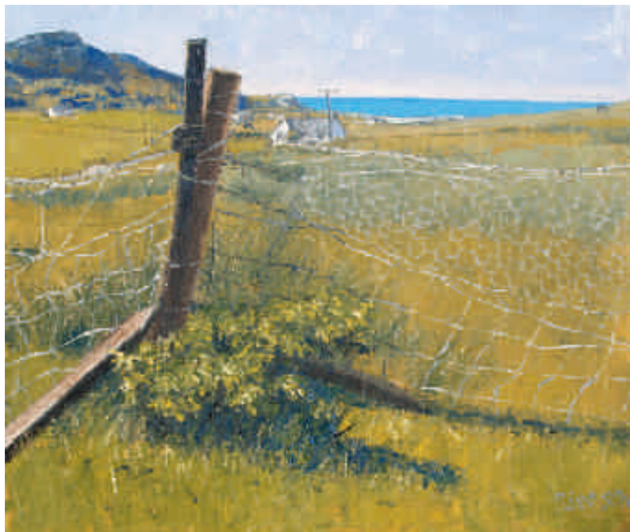
Corner of the Garden, Colonsay oil on canvas / 50 x 60 cm / 19.5 x 23.5 in