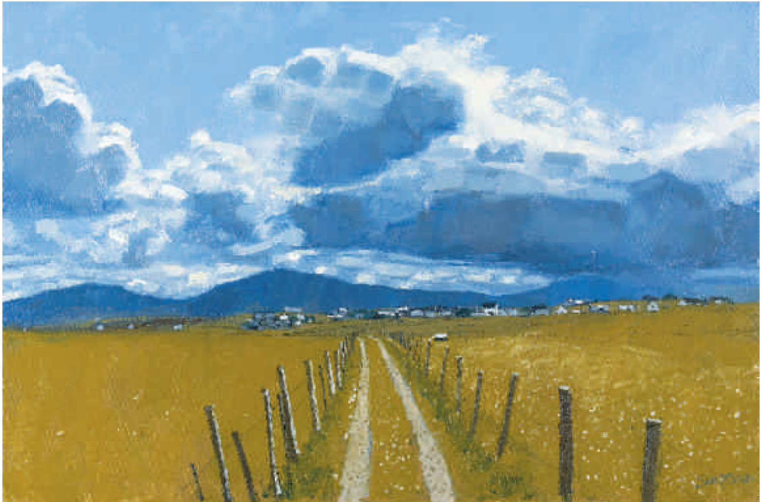
Durness Landscape oil on canvas / 60 x 90 cm / 24 x 35.5 in