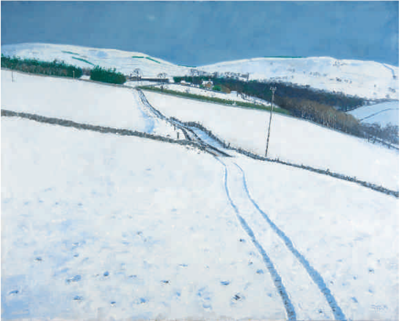
Tracks to Torwoodlee oil on canvas / 120 x 150 cm / 47 x 59 in