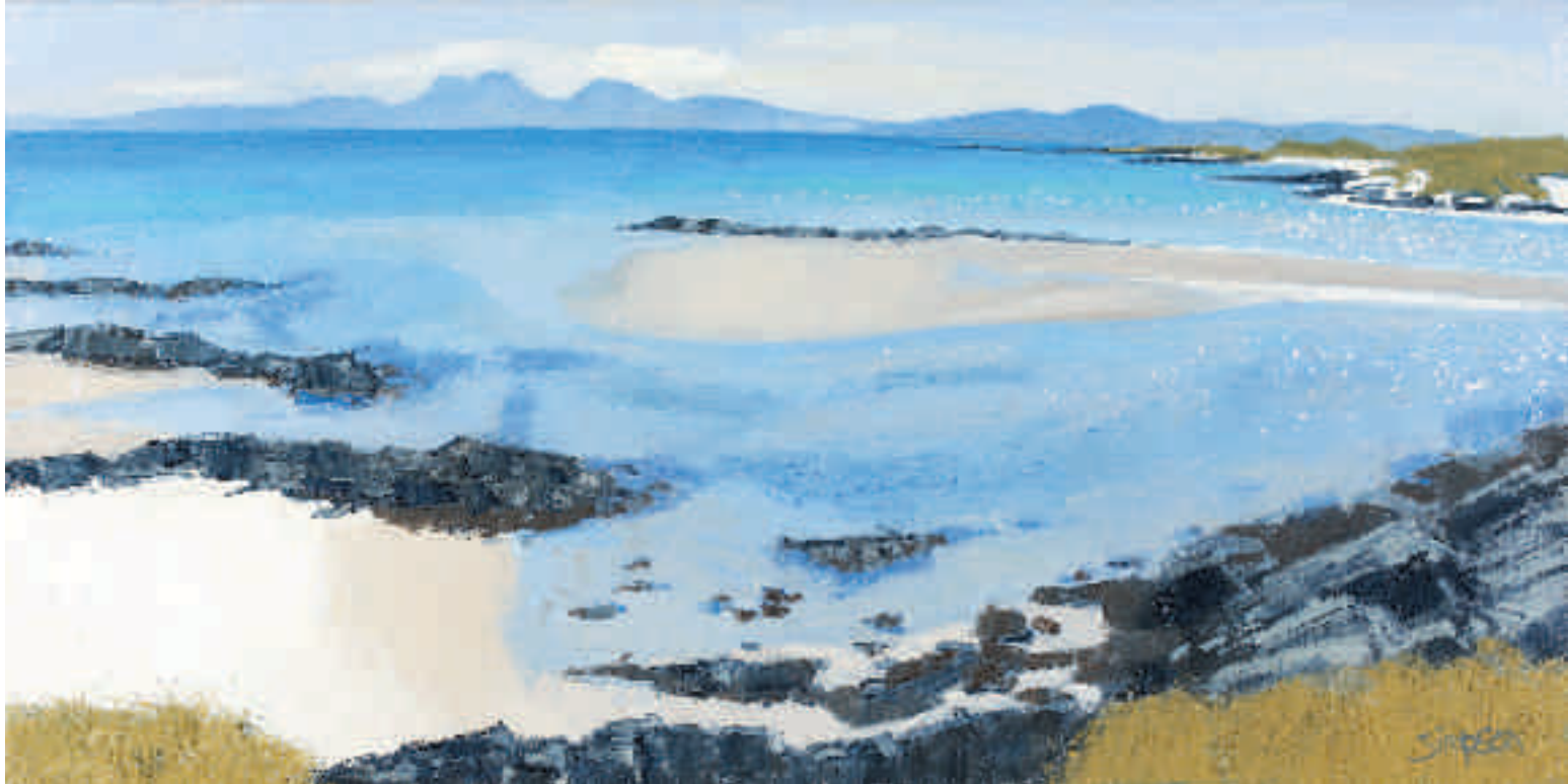
Sandbank, Colonsay oil on canvas / 50 x 100 cm / 19.5 x 39 in