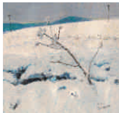
Covered in Snow Sango Bay Harsh Winter mixed media 19 x 20.5 cm / 7.5 x 8 in