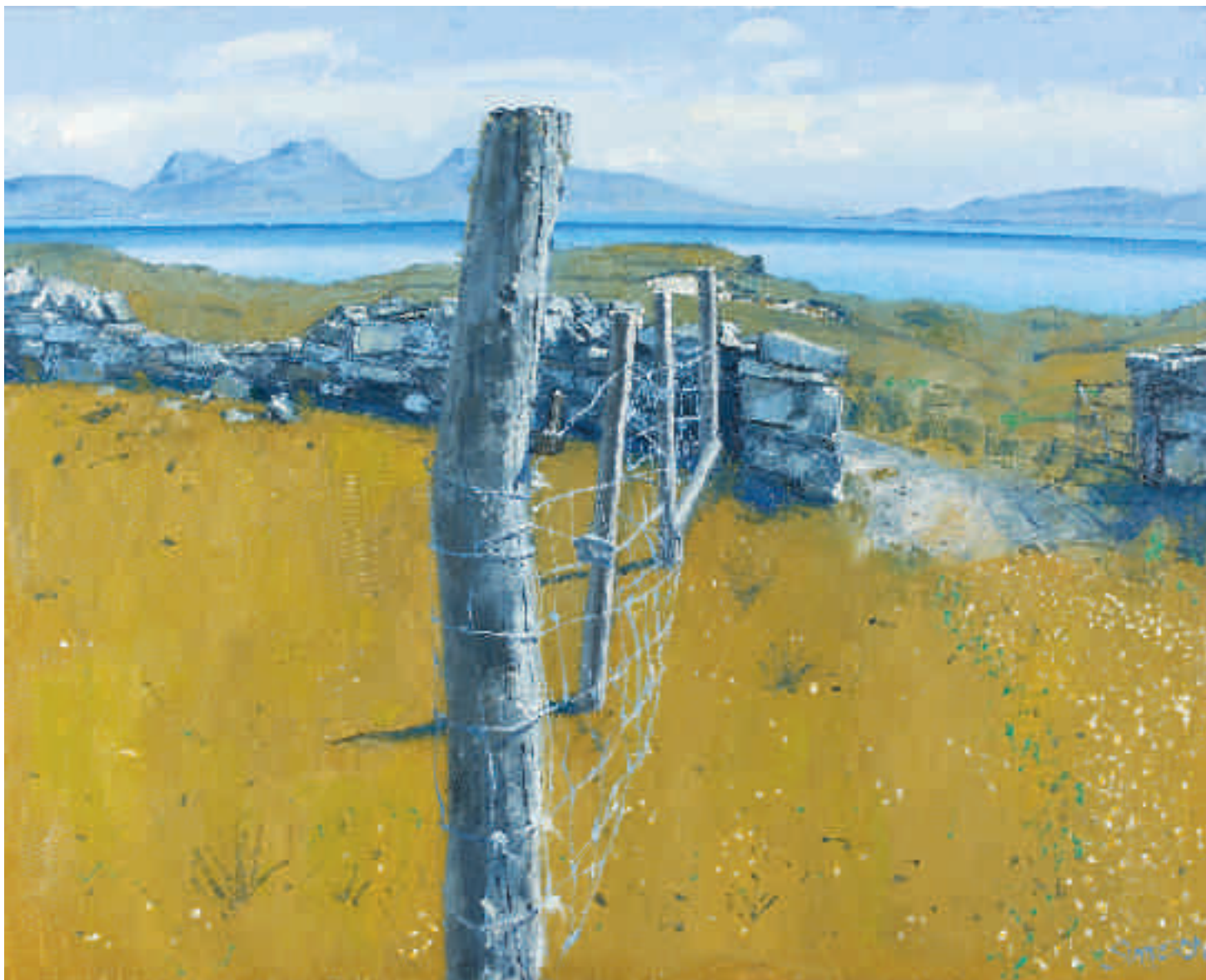
Path to Cable Bay

oil on canvas / 80 x 100 cm / 31.5 x 39 in