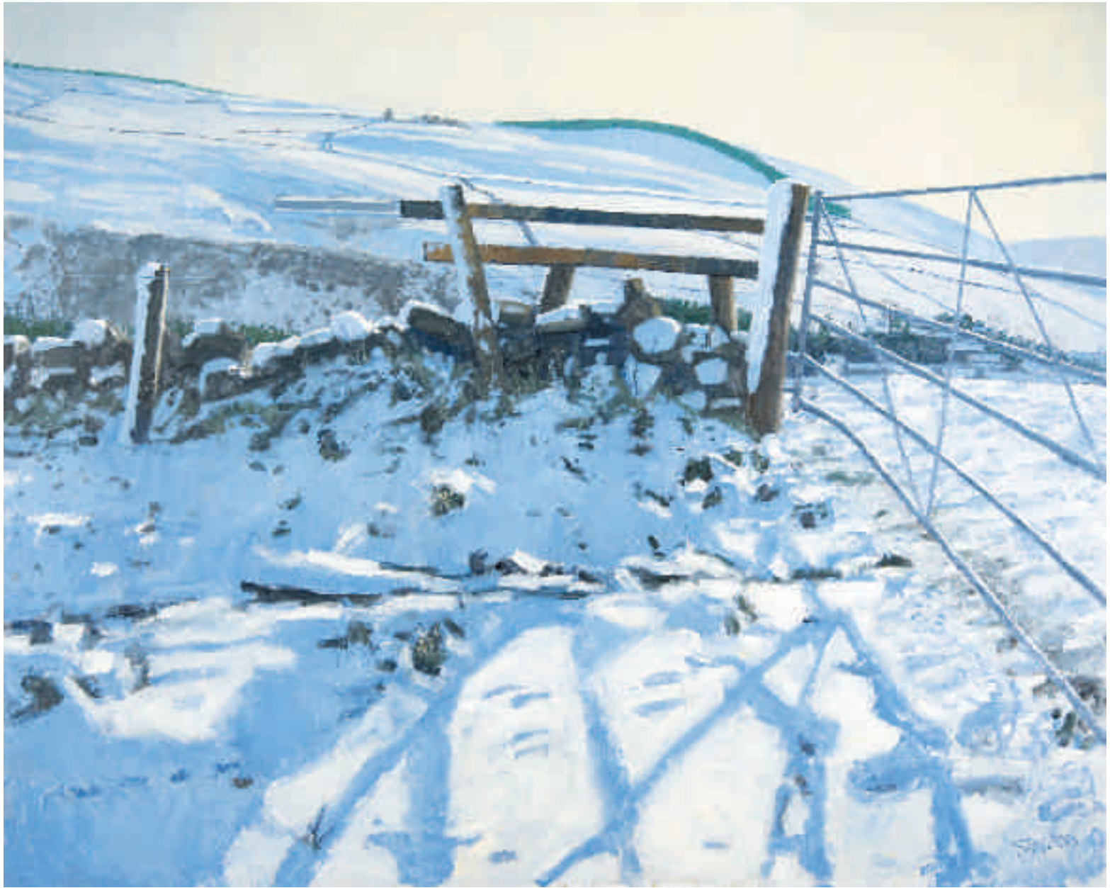
Farm Gate, towards Meigle Hill oil on canvas / 120 x 150 cm / 47 x 59 in