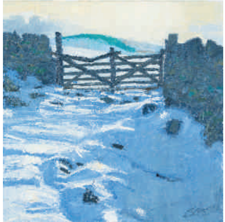
Snow Gate oil on canvas / 40 x 40 cm / 15.5 x 15.5 in