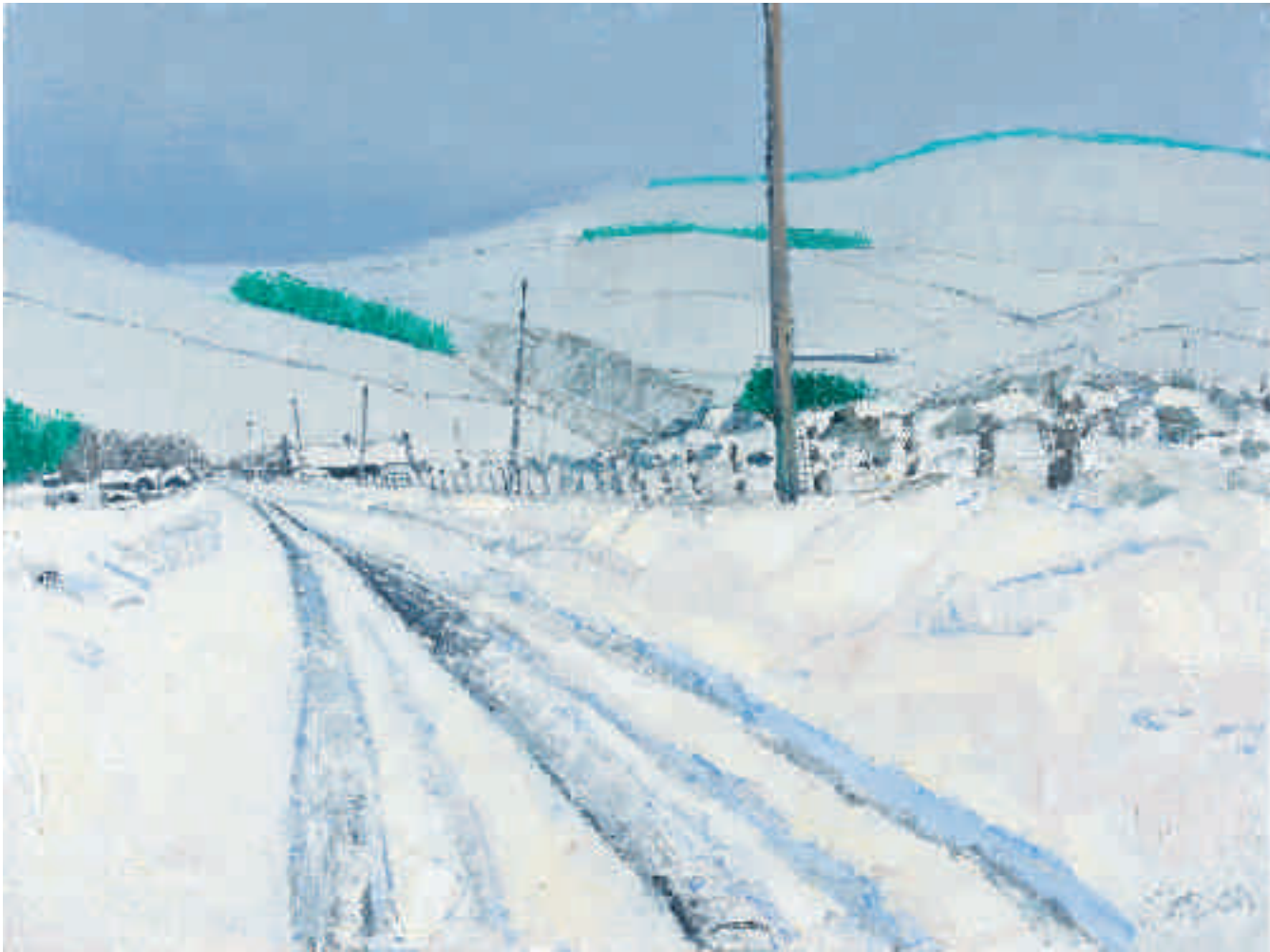
Snow, Ferniehirst Road oil on canvas / 60 x 80 cm / 24 x 31.5 in