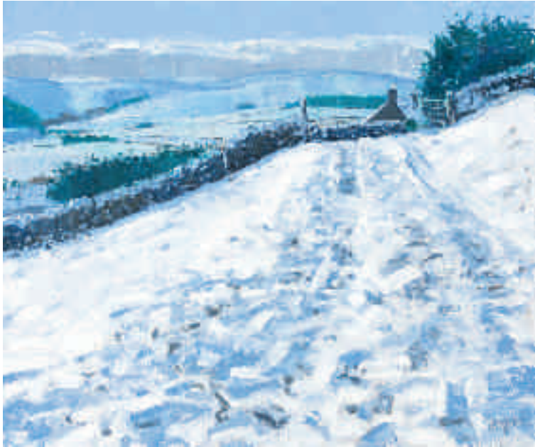
Open Gate, Hillend oil on canvas / 46 x 55 cm / 18 x 22 in