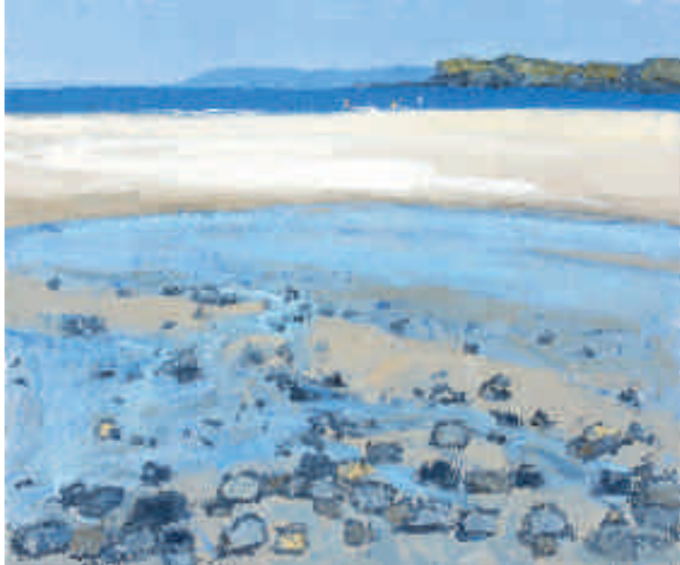
Low Tide, Kiloran oil on canvas / 46 x 55 cm / 18 x 22 in